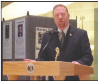
Senator Jason Holsman delivers remarks at a rally for increased early education funding with members of the Legislature during the 2013 session.

While I will continue to advocate for legislation such as SB 133, I am pleased to