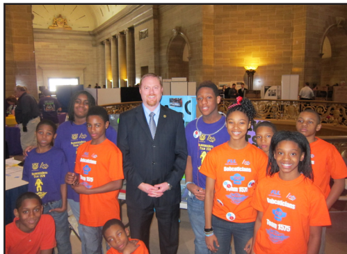
Senator Holsman visits with students from Benjamin Banneker's "Bobcaticians" robotics team in the rotunda of the State Capitol.