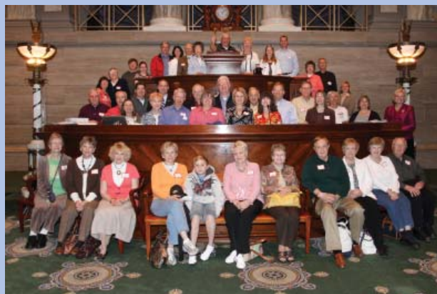
Senator Kraus meets with constituents during their visit to the Capitol on District Day 2011.

If you are interested in attending a 2012 District Day, please contact my office and we will put your name on a list to be notified when a date is set. We can be reached at 573-751-1464 or will.kraus@senate.mo.gov.