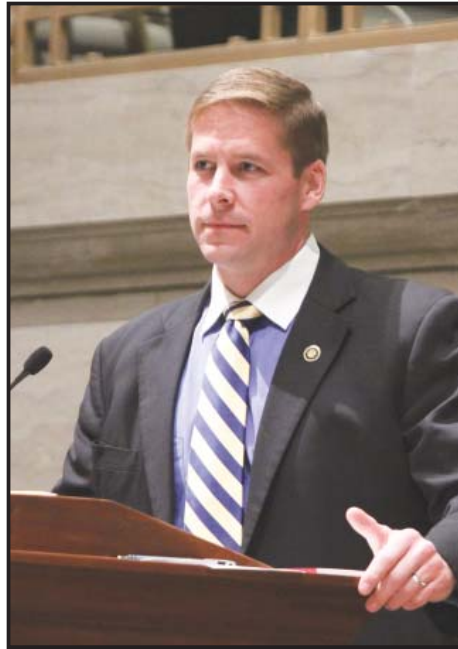
Sen. Kraus presides over the Senate from the dais.

House Bill 34 modifies how the prevailing wage is set for public works projects. This bill will help many rural counties by making the prevailing wage more reflective of what local contractors earn on similar projects. Reduced labor costs will allow counties and municipalities to complete public works