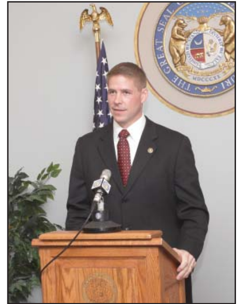
Sen. Will Kraus addresses members of the media in regard to SB 251.