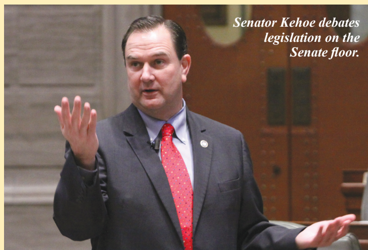
Senator Kehoe debates legislation on the Senate floor.

The constituents of the 6 th District are my priority. My Capitol office is available to assist with any local or other issues you may have. Please contact me or my staff at the number below. We will be happy to assist in anyway we can.