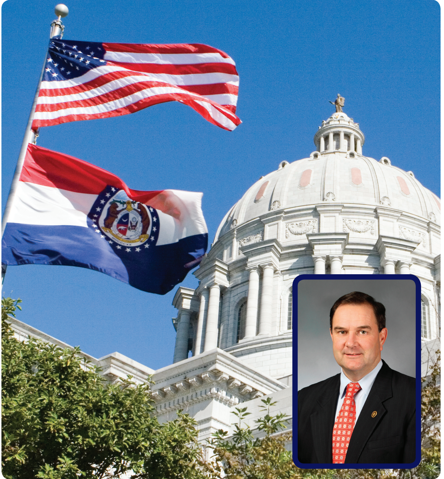
Senator Mike Kehoe - 6 th Senate District