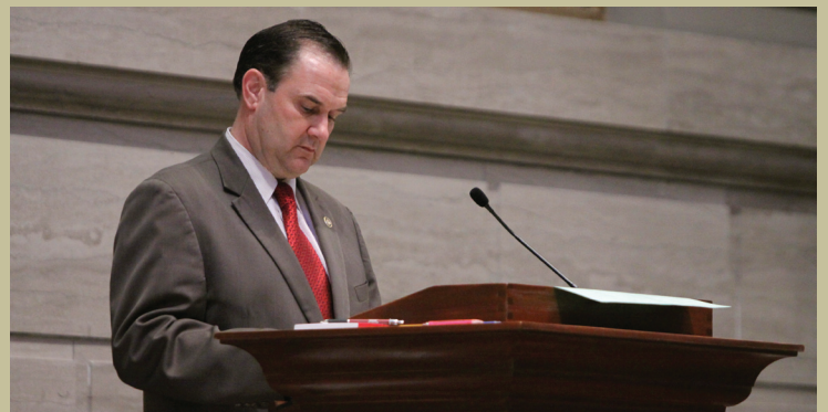
Senator Mike Kehoe details legislation and its importance on the floor of the Senate chamber.

Senate Bill 835 clarifies Missouri's previous firework and pyrotechnic rules, bringing the state in line with current federal regulations. This legislation benefits all citizens who purchase and enjoy fireworks, as well as local companies that manufacture those fireworks in the Show-Me State so that they can continue to thrive and benefit communities.