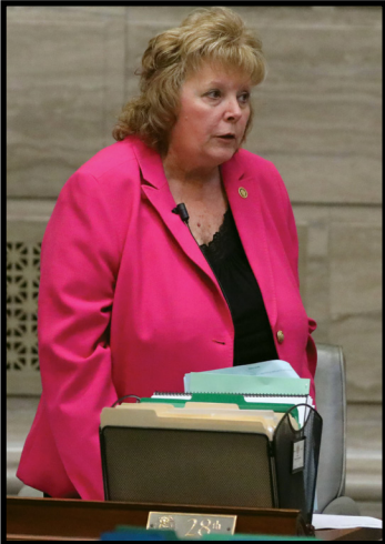
Senator Crawford debates HB 1606.

Passed by the Missouri General Assembly, House Bill 1606 is an omnibus measure with several provisions aimed at local and county governments. It provides flexibility in determining salaries for some county officeholders. It also allows a county collector to hold an auction of lands with delinquent property taxes through electronic media at the same time as the auction is held in-person, which comes from my Senate Bill 1144 .