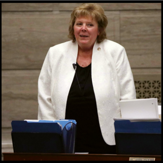
Senator Crawford discusses her legislation.

House Bill 2168 extends the Petroleum Storage Tank Insurance Fund through 2030, as spelled out in my Senate Bill 742 . This legislation also includes language that relates to electronic correspondence between a person and an insurance provider, which comes from Senate Bill 1042 , which I also sponsored this year.