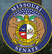
State Senator Eric Burlison