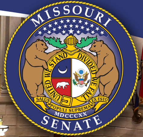
SENATOR DOUG BECK Proudly serving South St. Louis County in the Missouri Senate