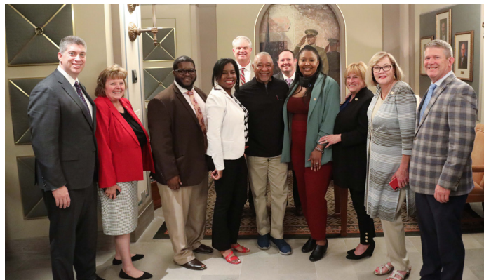
Cardinals fans welcomed legendary shortstop Ozzie Smith to the chamber during the 2021 legislative session.