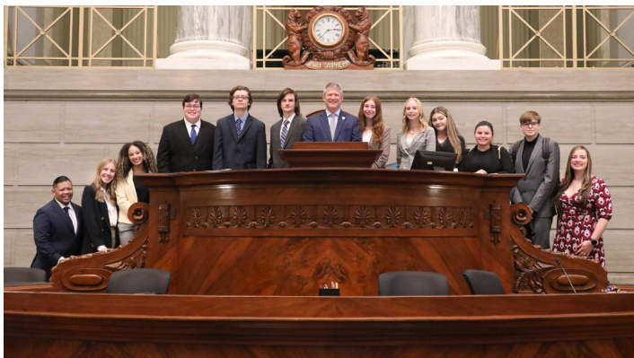
Students from Affton High School visited the Capitol on March 29 and were introduced on the floor of the Senate.