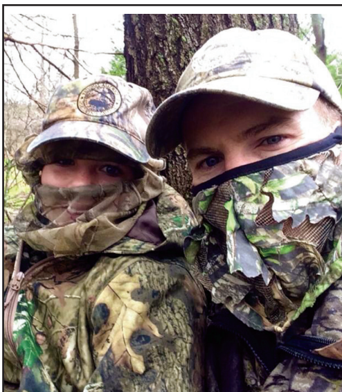
Senator Brattin and his daughter, Kayla, enjoy time on a turkey hunt.

Schell-Osage Conservation Area features a unique combination of habitats, including wetlands, upland and bottomland forests, cropland, old fields, lakes and ponds. The 1,425 acres of managed wetlands provide habitat for a wide variety of waterfowl, shore birds, wading birds and other wetland-dependent species, which makes this area popular for both waterfowl hunters and birders.