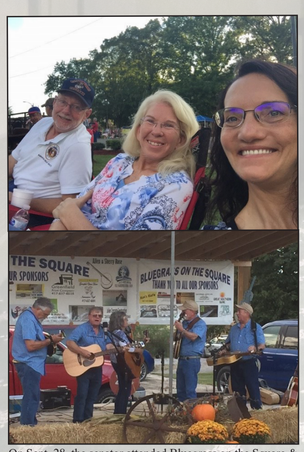
On Sept. 28, the senator attended Bluegrass on the Square & Fall Festival in Greenfield, Missouri.