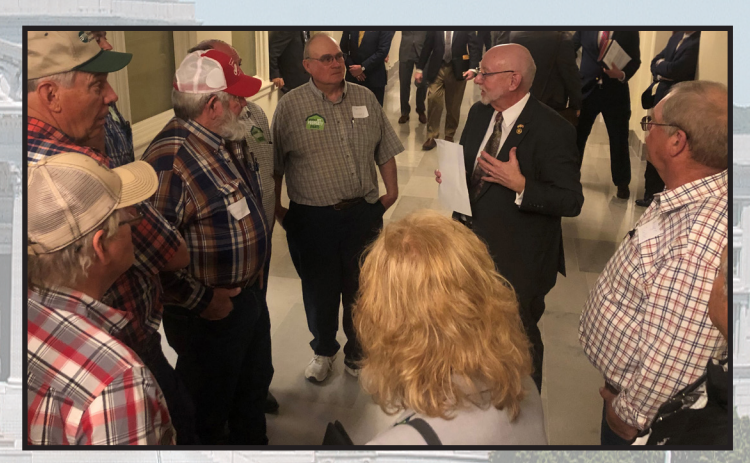
On April 16th, members of the Newton and McDonald County Cattlemen Association visited with Sen. White to advocate for Senate Bill 391.