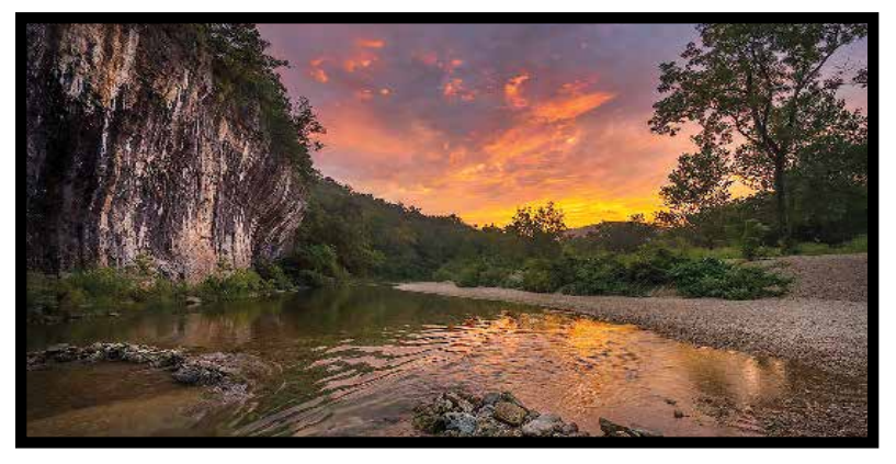
Echo Bluff State Park offers stunning views, camping, hiking and many other family-friendly amenities.

Please take the time and go visit YOUR newest state park. You will be impressed! For more info go to www.mostateparks.com