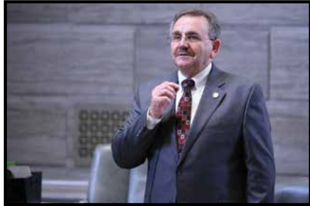
Senator Libla addresses his Senate colleagues during session.