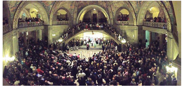
Medicaid rally at the Missouri Capitol.

The Missouri General Assembly was not able to reach a compromise to pass Medicaid expansion, allowing 200,000 low-income working Missourians access to health care.