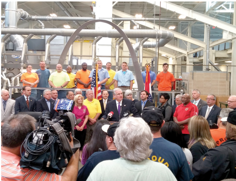
Above photo taken during the governor's press conference for the veto of the Right-to-Work legislation at the Sheet Metal, Air, Rail and Transportation Union, Local 36 in the City of St. Louis.

Right-to-Work legislation was unfortunately passed through the General Assembly, but then vetoed. The fate of this legislation could rest in the hands of the annual veto session, which is set for mid-September.