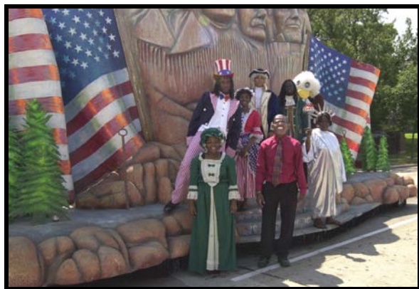
Fair St. Louis Mount Rushmore Float featuring costumed members of Mathews-Dickey.

I couldn't agree more. Thank you Mathews-Dickey, and here's to the next half century of success.