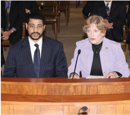
Eric Battle Children's Trust Fund Board