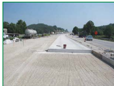
Interstate 55 at Barnhart looking north.

This spring work began on Interstate 55 between Route M and Route Z in Jefferson County. Interstate 55 in this area narrows from an eight-lane (four lanes in each direction) to a four-lane facility. Interstate 55 in this area currently has a high crash rate due to congestion, lane reduction, the design of the existing Route M interchange, and the distance to a nearby weigh station to Route M. Plans are to provide a transition from an eight-lane facility, to a six-lane