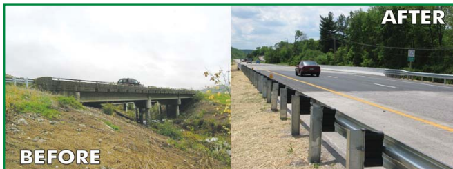
The bridge on Route 30 over Dulin Creek.

The Safe and Sound bridge program plans to repair or replace 802 bridges in the state and then maintain them for 25 years after work is complete. In 2007, the Legislature changed the bonding laws in the state so that the project could begin. To date, 152 bridges have been completed and 54 are under construction. In Jefferson County, we have seen results with the rehabilitation of the bridge on Route 30 over Dulin Creek. You can see more about bridge projects planned in our area by visiting www.modot.mo.gov/safeandsound .