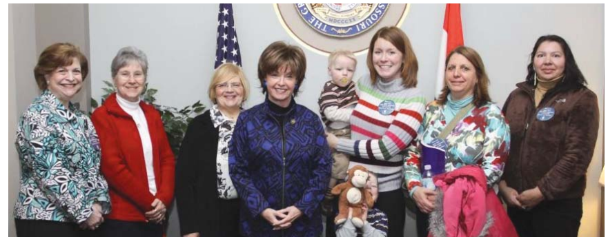
Parents as Teachers representatives with Senator Cunningham.

District 1 - William “Lacy” Clay ..... (202) 225-2406 131 Cannon House Office Building, Washington, D.C. 20515 Internet - lacyclay.house.gov District Office: 8021 W Florissant Ave, Ste F, St. Louis 63136.....(314) 383-5240 District 2 - Todd Akin ..... (202) 225-2561 117 Cannon House Office Building, Washington, D.C. 20515 Internet - akin.house.gov District Office: 301 Sovereign Ct. Ste. 201, St. Louis 63011 ..... (314) 590-0029