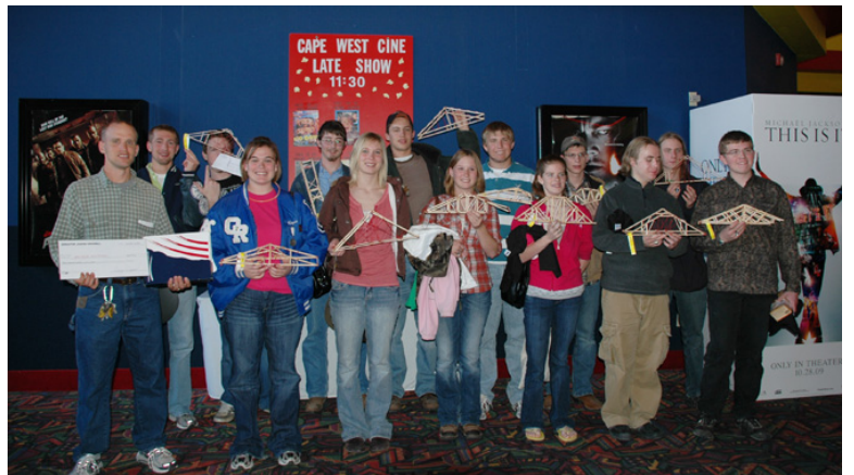
The second place Oak Ridge High School team.