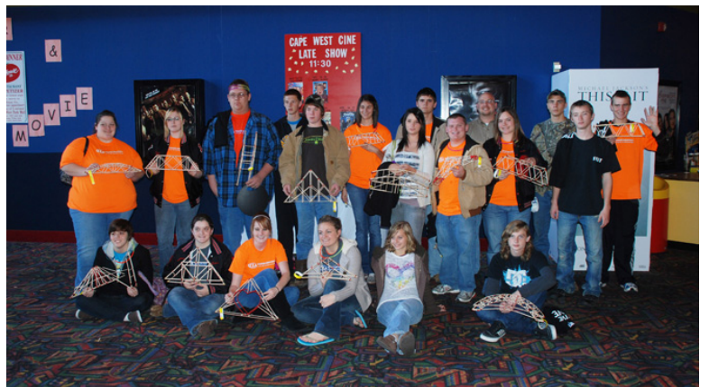
The third place Chaffee High School team.

The talents of our local students reach outside the classroom and onto the courts and fields in a