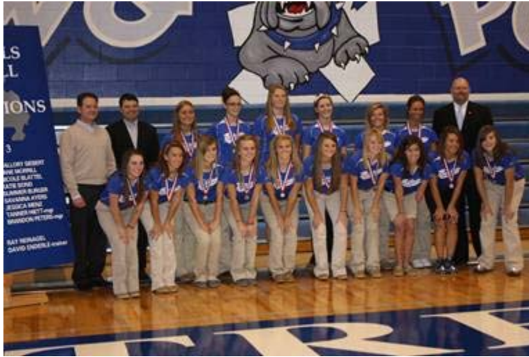
The Notre Dame softball team poses for photos after their celebration assembly

The Notre Dame softball team won the Missouri State High School Activities Association Class 3 championship. On October 25 th , the Bulldogs completed a perfect game to beat Kirksville High School 3 to 0 in the championship, finishing the season 30-2. The victory for Notre Dame was the first time in school history that the softball team took home the state title.