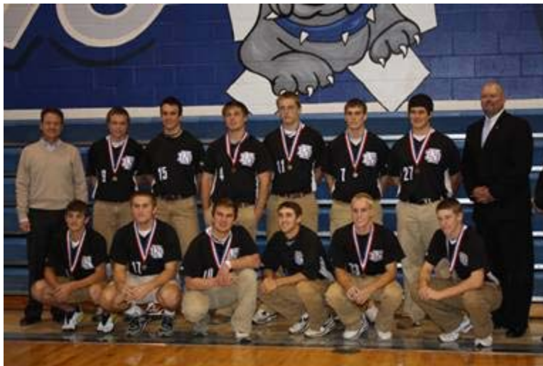
The Notre Dame baseball team celebrating their state championship victory

The Notre Dame softball team won the Missouri State High School Activities Association Class 3 championship. On October 25 th , the Bulldogs completed a perfect game to beat Kirksville High School 3 to 0 in the championship, finishing the season 30-2. The victory for Notre Dame was the first time in school history that the softball team took home the state title.