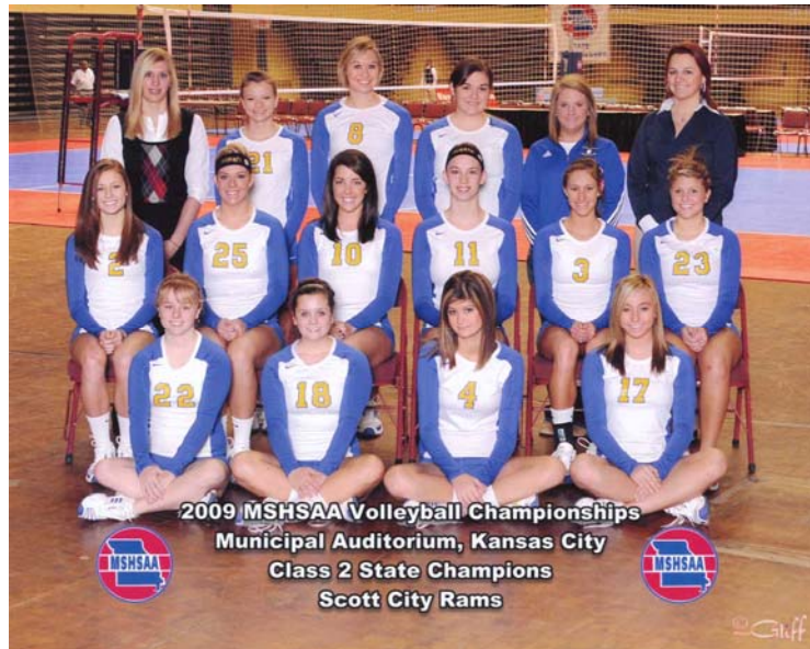
The Scott City High School Volleyball Team

The Scott City High School volleyball team recently earned the Class 2 State Championship. The Lady Rams defeated Hermann on Nov. 7 th , to take first place in the championship.