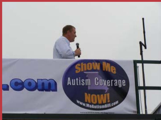
Sen. Schmitt talking about the importance of autism therapies.