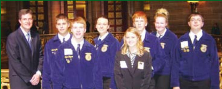
Livingston County FFA students visited with Sen. Lager during the 2009 Farm Bureau Youth Leadership Day.