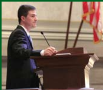
Senator Lager presides over the Missouri Senate.

If our state government is going to continue to be in the business of providing economic subsidies, then it should be done in a transparent manner that maintains strict accountability to the taxpayers of this state.