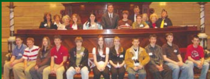
Students from throughout Northwest Missouri traveled to the Capitol to participate in the 2009 State Youth in Government Day.