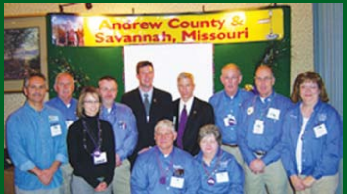
The 2009 Great Northwest Days brought county officials from throughout the 12th Senate District to Jefferson City.