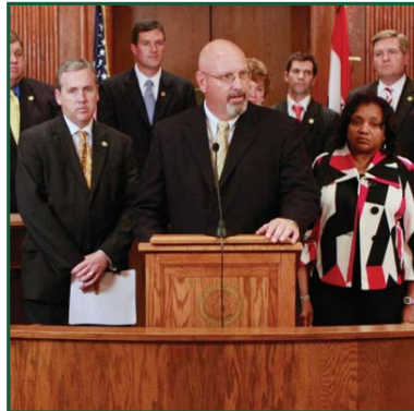
Senator Engler during a press conference on the last day of session.

The Senate also added important tax credit reforms to HB 191 to make sure the programs designed to attract and help businesses in our state are effective, and tax credits are spent in a fiscally prudent manner.