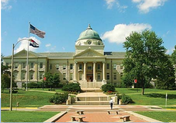
Southeast Missouri State University

Missouri students will only be able to compete in a global economy if they have the opportunity to receive a quality higher education. Despite a difficult budget year, higher education received a 3.2 percent increase this year for a total of $1.3 billion.