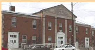
Juvenile Court, Jefferson County receives $132,546.