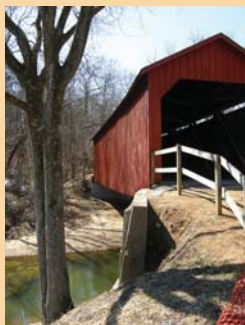
Sandy Creek Covered Bridge receives $12,943.