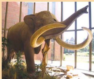
Mastodon State Historic Site receives $291,102.