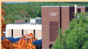
Jefferson College Receives $8.4 million.

This session, the General Assembly passed a $23.1 billion spending plan that includes specific appropriations for Northern Jefferson County. Additional budget information is available on the following page.