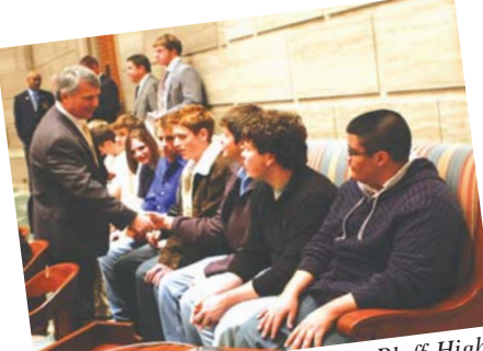
Sen. Mayer visits with Poplar Bluff High School students.