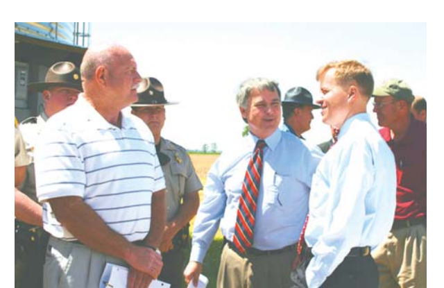
Sen. Mayer, flanked by Stoddard County Sheriff Carl Hefner and Governor Matt Blunt, during the copper theft bill signing in Dexter.

Senate Bill 1034 now requires stronger recordkeeping by scrap dealers and increases the penalties for stealing or unlawfully selling copper, brass, bronze or aluminum. Under the new requirements, scrap dealers are required to obtain a driver's license and other sales transaction information from customers and to maintain those records for at least two