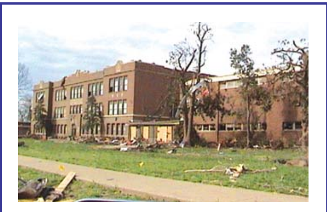
The Caruthersville High School suffered extensive damage following an April 2006 tornado and must be rebuilt to strict standards because of its location within the New Madrid Fault Zone.

Under the program, school districts eligible for the Rebuild Missouri Schools Program must have experienced a pre-set level of damage or destruction as determined by the Federal Emergency Management Agency (FEMA) due to an act of God.