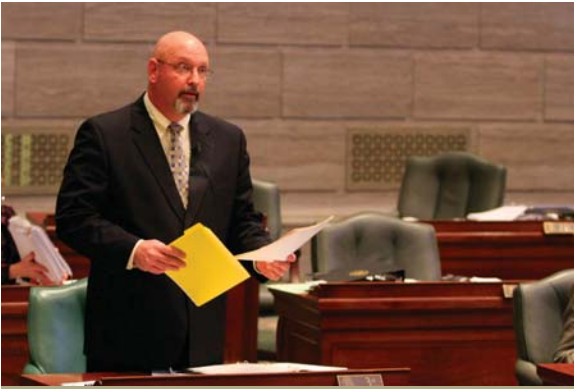
Sen. Engler introduces legislation in the Senate.