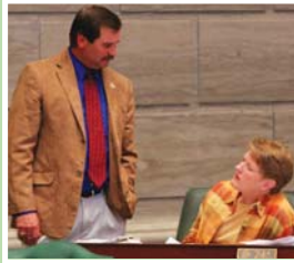
Sen. Wes Shoemyer and Sen. Bray

Telephone rates charged for traditional land line service in rural areas are sure to go up after passage of House Bill 1779.