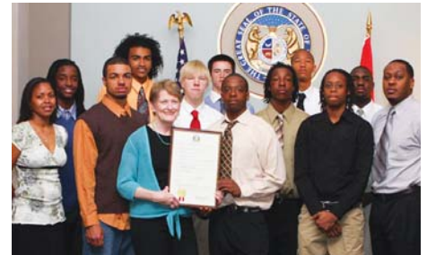
Sen. Bray and the Maplewood-Richmond Heights High School State Championship Basketball Team

The bill also includes language I sponsored to create the necessary boards and committees that are needed to obtain millions in federal funds in the coming years, as well as protections for consumers from electric rate increases of more than 1 percent per year due to any mandated use of more renewable energy sources. This and the other programs created in the bill signal that the state is finally ready to make a commitment to energy conservation.