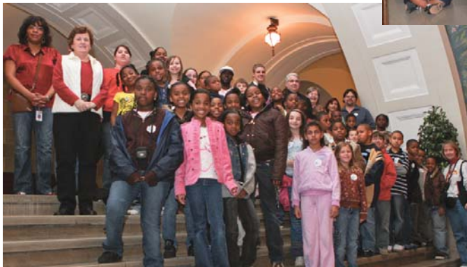
Robinwood Elementary, 4th Grade