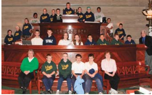
St. Angela Merici, 7th Grade