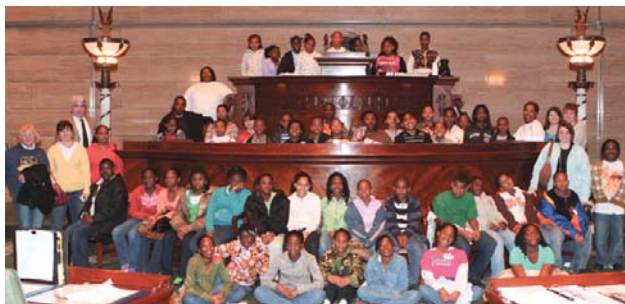
Glasgow Elementary, 5th Grade