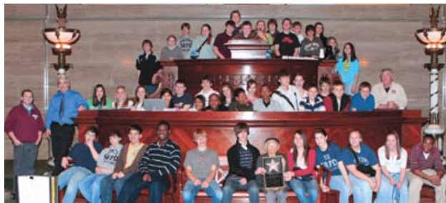
St. Rose Philippine Duchesne, 8th Grade