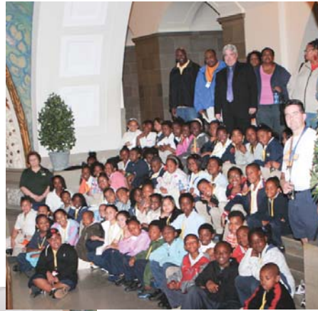
Jamestown Elementary, 4th Grade