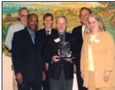
Grand Oak Hill Community Award.

This legislation applies to neighborhood organizations in St. Louis, Kansas City and Springfield, and in Platte, Jefferson, and St. Louis counties.