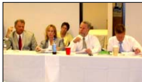
Medicaid Reform Commission Hearings.