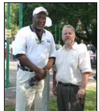
Attending a Neighborhood Outing in the 26th Ward.