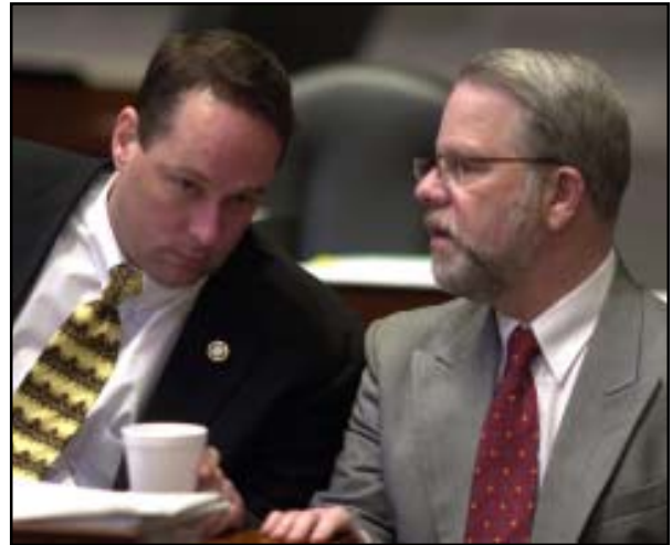
Sen. Dougherty discusses legislation on the Senate floor with Sen. Chuck Graham.

For an application or more information, contact Social Security at (800) 772-1213 or visit www.socialsecurity.gov , or Medicare at (800) 633-4227 or visit www.medicare.gov .