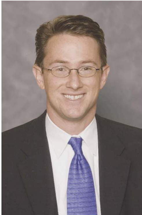
State Senator Matt Bartle District 8