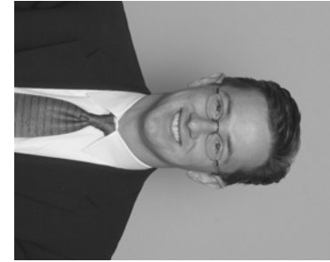
MISSOURI STATE SENATE MATT BARTLE State Capitol Building Jefferson City, MO 65101