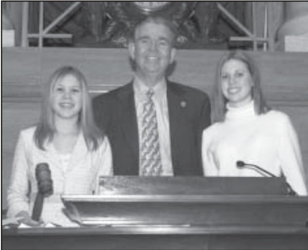
Two students from the Mehlville School District visited the Capitol on Feb. 21.

If you're planning a trip to Jefferson City, please let us know. We can schedule tours at attractions such as the Capitol, Governor's Mansion or Supreme Court. These places are most popular from January through May when the legislature is in session, so it is best to schedule tours during this time at least three months in advance.