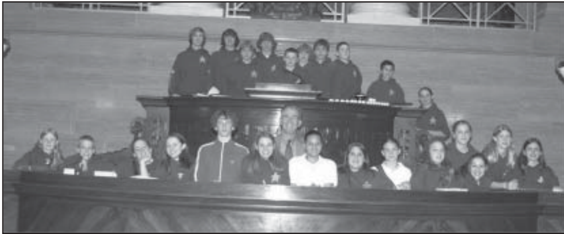
St. Mary Magdalen, my alma mater, came to Jefferson City for its annual eighth-grade field trip March 8. Unfortunately, the school will be closing at the end of this year.