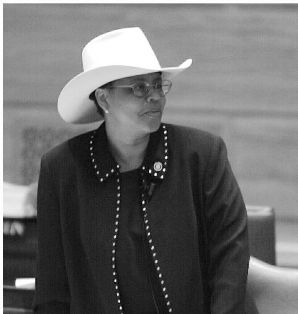
Sen. Coleman stands in the Senate Chamber preparing for a legislative showdown.