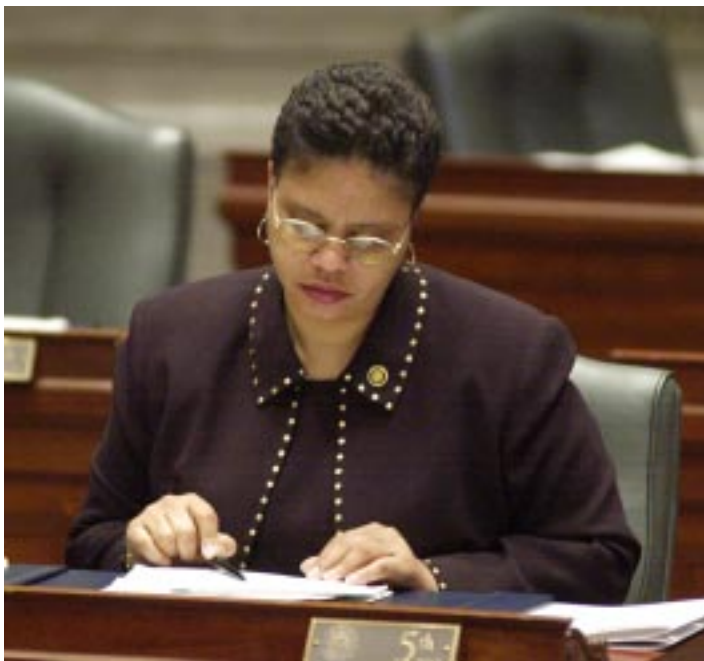
Sen. Coleman preparing for debate.

Despite unanimous passage in the Senate, the House did not take this bill up. When we convene in January, passing this important legislation must be a top priority to ensure that all low-income senior citizens have access to medication they need.