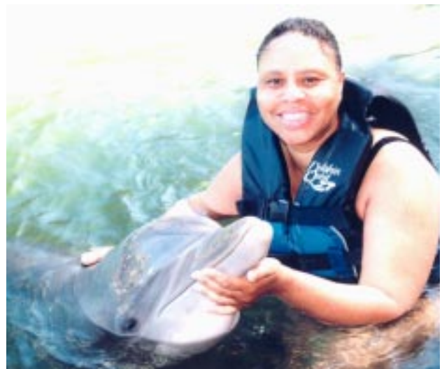
Although I swim, I'm terrified of water (I almost drowned when I was 11). That's why while vacationing last summer, I decided to fight my fear by swimming with the dolphins. (I left the sharks behind in Jefferson City!)