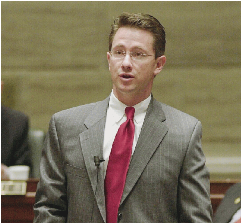
District 8 State Senator Matt Bartle